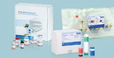
Reagent Sets + Cassettes