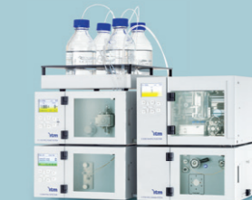
Quality Control Solution