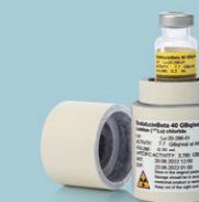
Radioisotopes + Targeting Molecules

Get all components and services from one supplier!