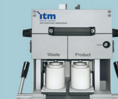
iQS® Ga-68 Fluidic Labeling Module