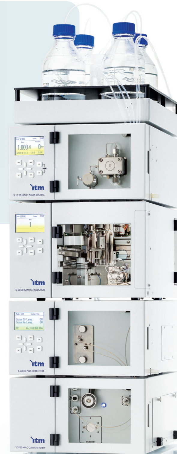
Quality Control Solution with an Autosampler and PDA Detector

Upon request, the standard configuration can be upgraded or modified according to your specific requirements (e.g. autosampler, column switching valve, different detectors Photo-Diode Array, Refractive Index Detector, Conductivity Detector).